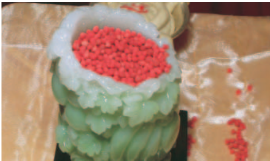
One hour later after dharma was practiced at the Food Offering Dharma Assembly, the nectar pills instantly grew in number, filling the entire bowl and lots of nectar pills dropt to the table. 上供法會修法一個小時之後，甘露丸剎那暴漲，漲平成了滿鉢，很多掉在法台上。

inside a jade bowl. At that time, the nectar pills were level with the lower edge of the brim of the bowl. Those nectar pills were piled up evenly and filled the entire bowl. The Buddha Master later empowered the fifty-nine attendees of that dharma assembly by giving each of them some of those nectar pills. As a result, the nectar pills that remained in the jade bowl were lower than the lower edge of the brim of the bowl by about 1.5 centimeters. We saw that the nectar pills neither lessened nor increased from 7:03 p.m. when the practice of the dharma began until around 8:10 p.m. when the offerings of the three karmas to the Buddhas was completed. At that time, a holy event nobody ever imagined suddenly took place. In an instant, the nectar pills grew in number. Not only did the pile of nectar pills rise more than 1.5 centimeters filling the entire bowl, its top part formed a dome that rose high above the brim. Everyone was ecstatic at the sight of that holy