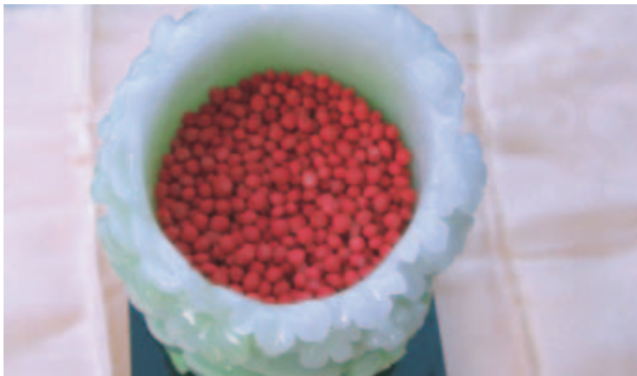
After the nectar pills were distributed to attendees and before dharma was practiced at the Food Offering Dharma Assembly, the bowl of nectar pills was not full. 在將金剛丸分發給參加法會的人之後而在上供法會修法之前，沒有滿的一鉢甘露丸。