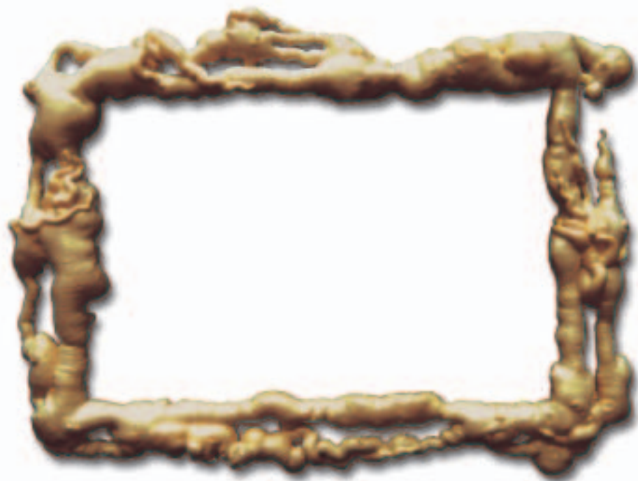
Elegantly Sculpted Tree Roots 雕塑高雅樹根框