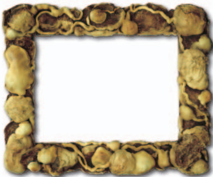
The sculpture Jun Ling Zhi 雕塑葶靈芝