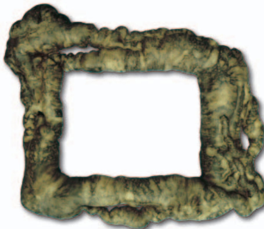
The sculpture Zi Tan 雕塑紫檀