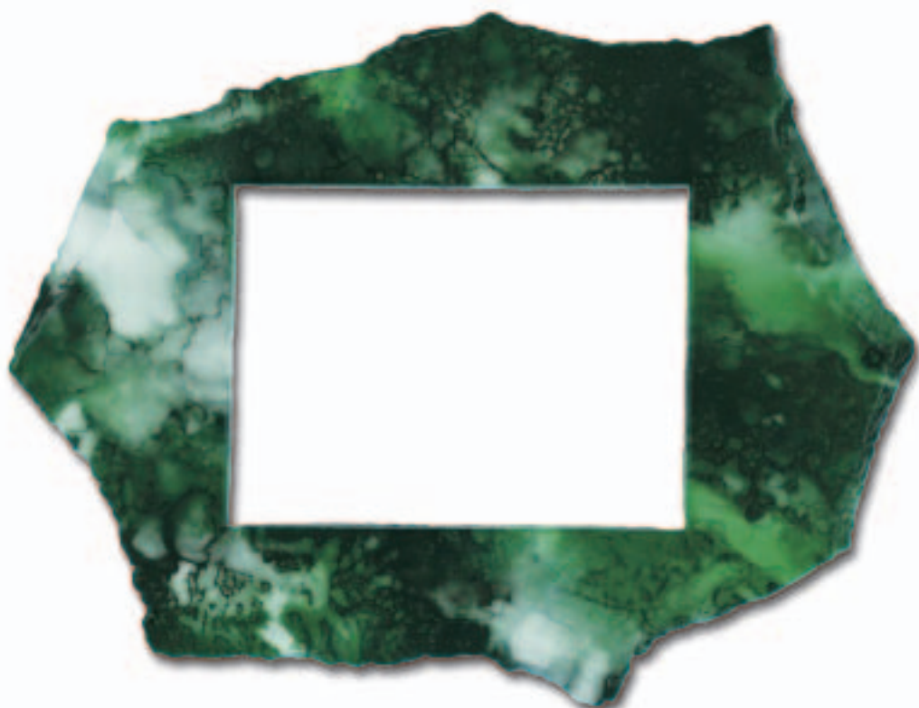
The sculpture Fei Cui Yu 雕塑翡翠玉