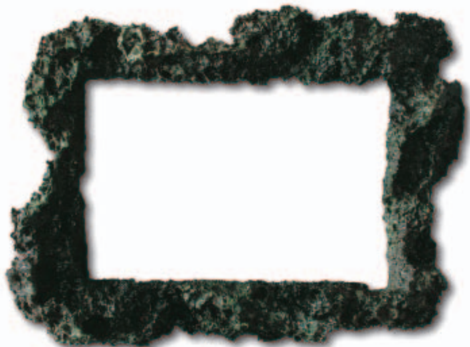
The sculpture Feng Gang Yu 雕塑鋒鋼玉