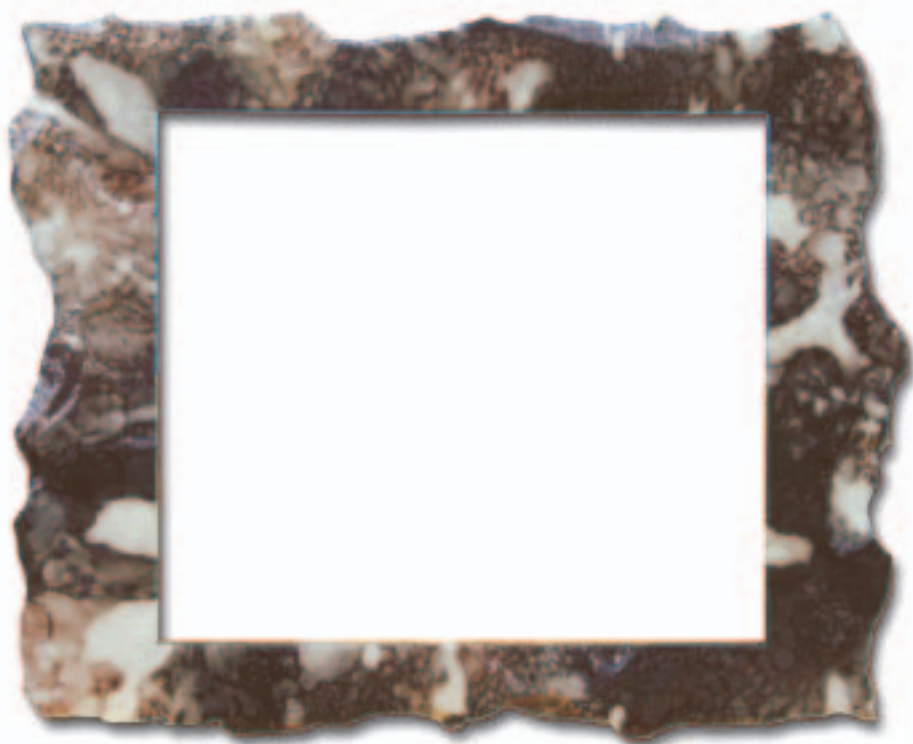
Tallow Jade Made With Ease 羊脂小弄