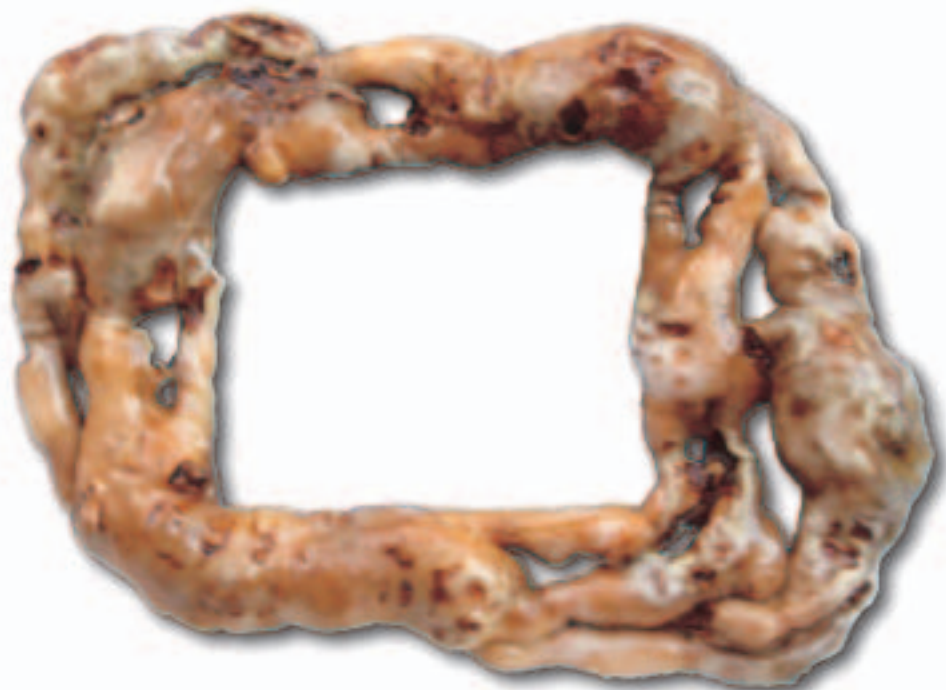
The sculpture Lao Can Gen 雕塑老殘根