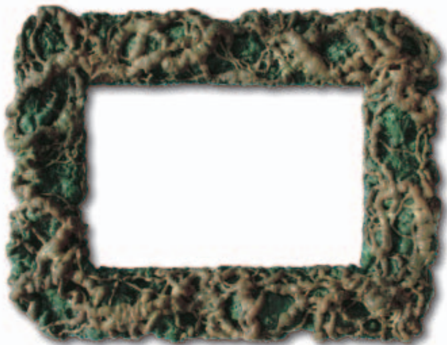
The sculpture Zi Luo Bao Shi 雕塑紫蘿抱石