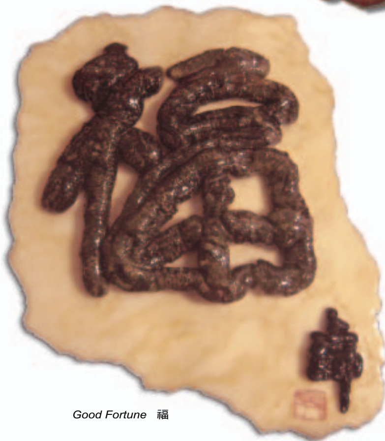
Good Fortune 福