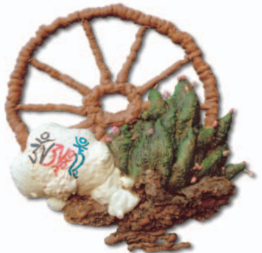
Mani Treasure 瑪尼藏