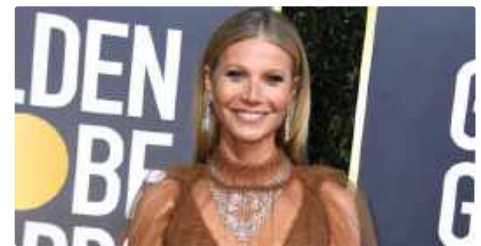
Gwyneth Paltrow celebrates 48th birthday by posing in her 'birthday suit' — and daughter Apple's reaction is priceless