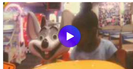
No charges yet filed in girl's East Garfield Park stabbing death; grandfather claims mother is suspect