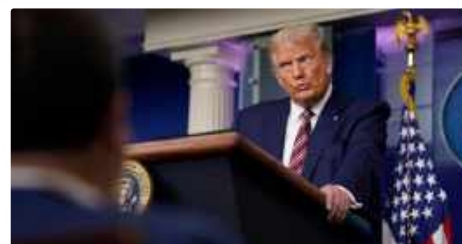
Trump Holds $421 Million In Debt, Could Owe IRS $100 Million In Penalties, Times Says HuffPost