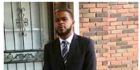
Ballistics report doesn't support Kentucky AG's claim that Breonna Taylor's boyfriend shot cop