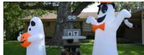
One man's secret to a socially distant Halloween: A robot who'll deliver candy to trick-or-treaters