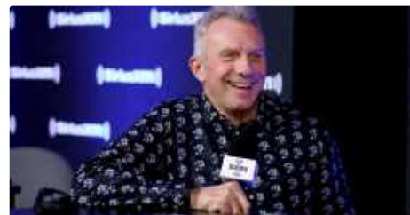
Joe Montana reportedly confronts intruder who was allegedly kidnapping his grandchild Yahoo Sports