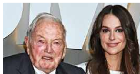
These Are The Wives Of The Richest Men On Earth