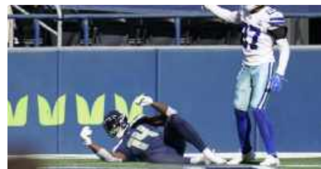
Blooper of the year? DK Metcalf blows a TD, fumbles when he eases up before he crossed the goal line