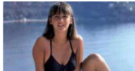
The 50 Most Beautiful Women Of All Time ... Ad • Crowdifyfan